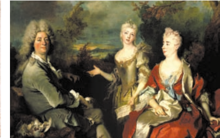
Nicolas de Largillière (1656-1746) Group portrait, said to be the artist and his family