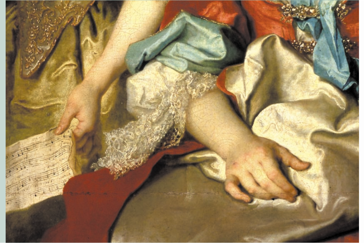
Nicolas de Largillière (1656-1746) Group portrait, said to be the artist and his family (detail)

Working in tandem with the wealth managers of BNP Paribas Private Bank, Conseil Investissement Art can help you maximise these benefits. Their professional judgement ensures that works selected in your chosen area of interest meet the highest standards. In this field there can be no doubt that quality is the key to successful long-term investment.