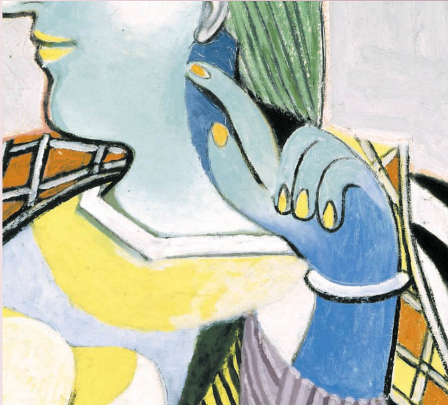
Pablo Picasso (1881-1973) Portrait de Marie-Thérèse, 1937 (detail)

Our specialists aim to be consistently well informed on the state of the art market. Whether you wish to buy or to sell, Conseil Investissement Art can advise you by researching prices, provenance, and authenticity and examining condition, thus ensuring an objective and unbiased assessment of quality.