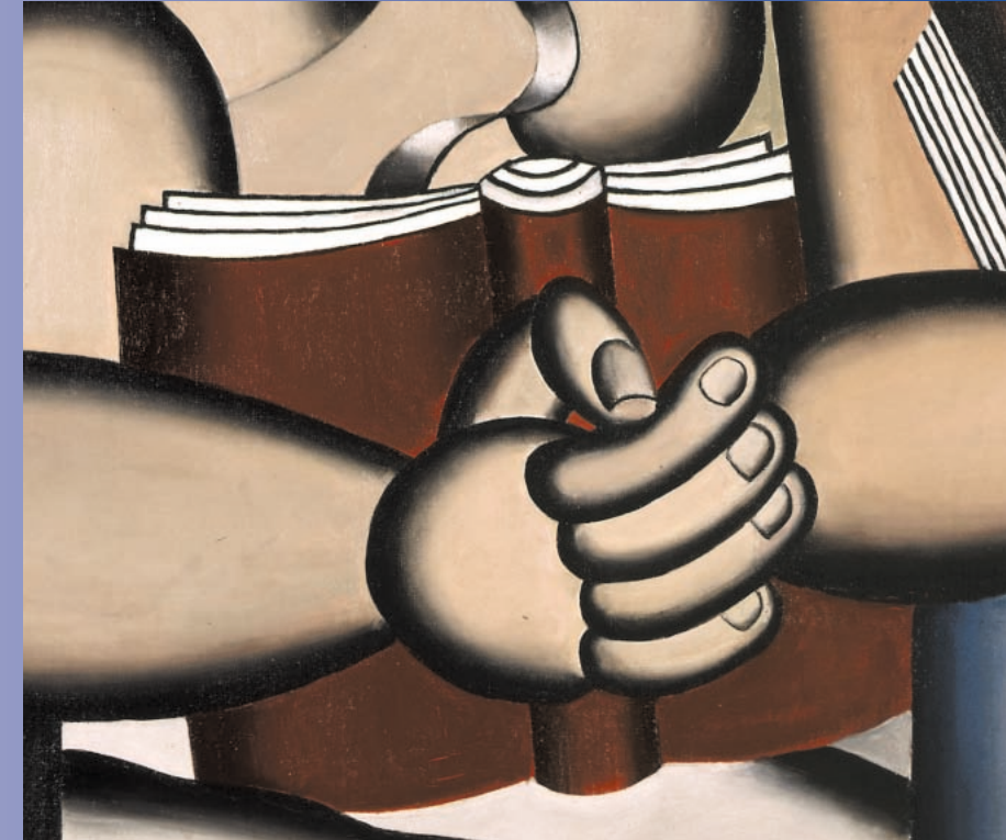
Fernand Léger (1881-1955) La Lecture, 1924 (detail)

The art advisory service of the Private Bank owes its reputation to its independence, its high standards and to the unique combination of artistic and financial asset management that it can offer to its clients.