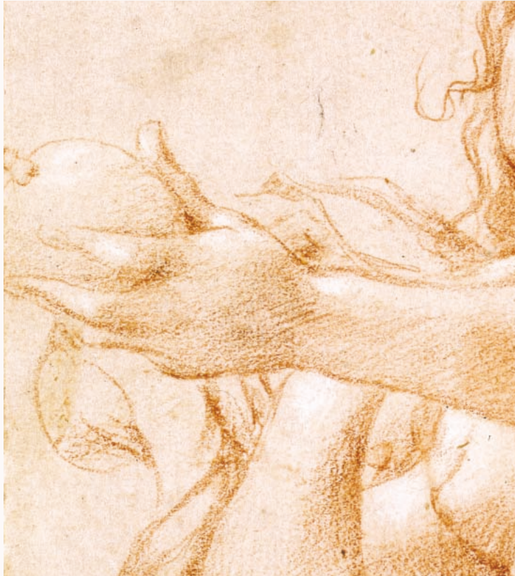
Antonio Allegri, Il Correggio (1489-1534) Eve offering the apple (detail)

Whether you are a seasoned collector, or ready to make your first purchase on the art market, Conseil Investissement Art, a subsidiary of BNP Paribas Private Bank, puts at your disposal a department specialised in the negotiation of acquisitions and sales of works of art.