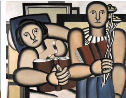
Fernand Léger (1881-1955) La Lecture, 1924