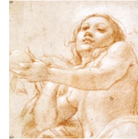
Antonio Allegri, Il Correggio (1489-1534) Eve offering the apple

33, RUE DU QUATRE SEPTEMBRE 75002 PARIS TEL. 33 (0)1 42 98 02 20 FAX 33 (0)1 42 98 75 10