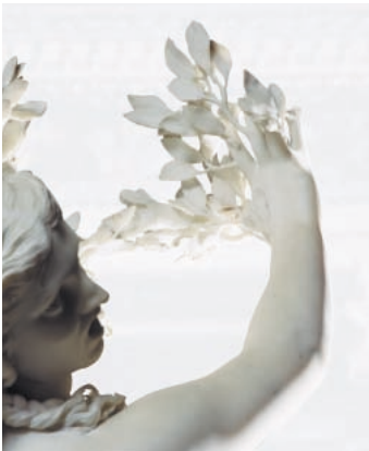
Gian Lorenzo Bernini (1598-1680) Apollo and Daphne (detail)